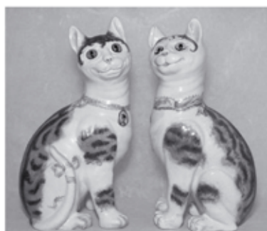
Pair of Emille Galle faience cats. c.1890

MEMBER OF THE BRITISH ANTIQUES DEALERS ASSOCIATION