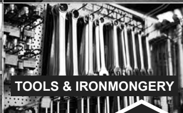
TOOLS & IRONMONGERY

Firth Street, Skipton, North Yorkshire BD23 2PX The Butts, Barnoldswick, Lancashire BB18 5HP www.merrittandfryers.co.uk