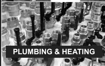
PLUMBING & HEATING